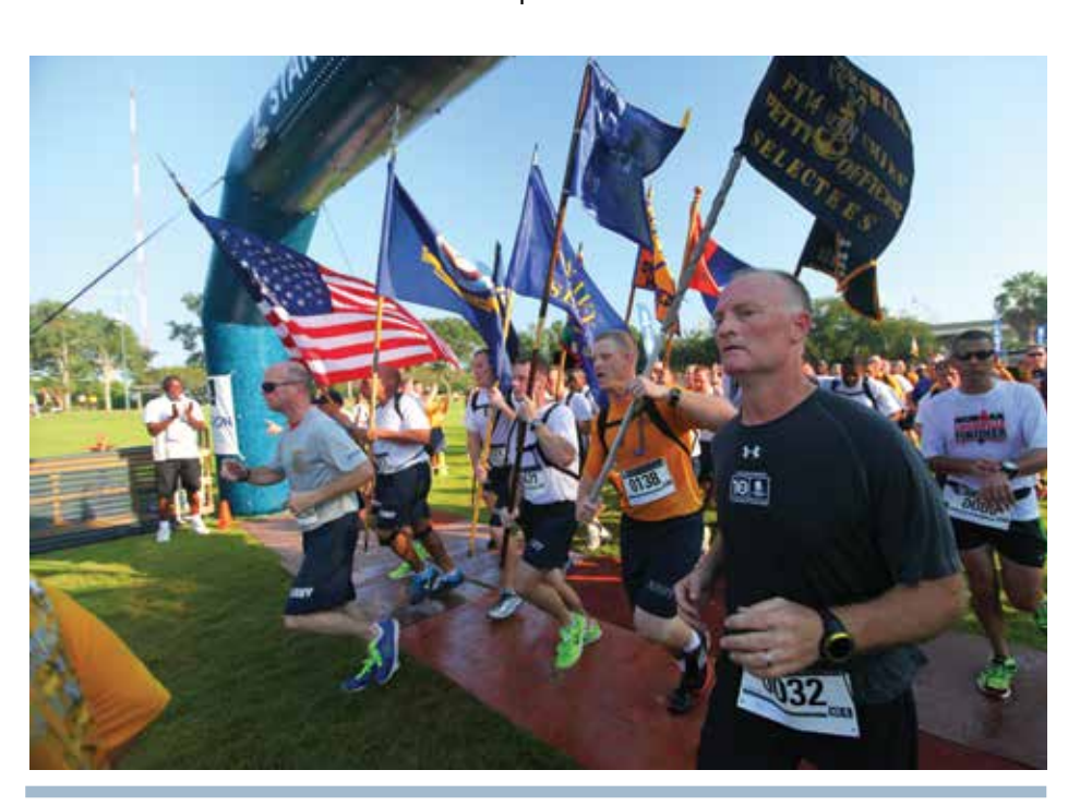
WOUNDED WARRIOR PROJECT® 8K RUNS unite runners and WWP enthusiasts in select cities across the United States.

THE COURAGE AWARDS & BENEFIT DINNER® is the pinnacle fundraising event for Wounded Warrior Project. On this special evening, we recognize warriors and their families, as well as influential individuals in our communities for their dedication to our mission to honor and empower Wounded Warriors.